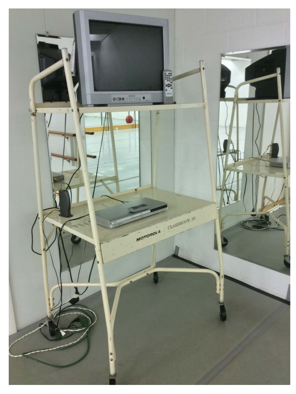
Here is a TV with remote, a DVD player with remote, and a Video/TV stand all for $50.